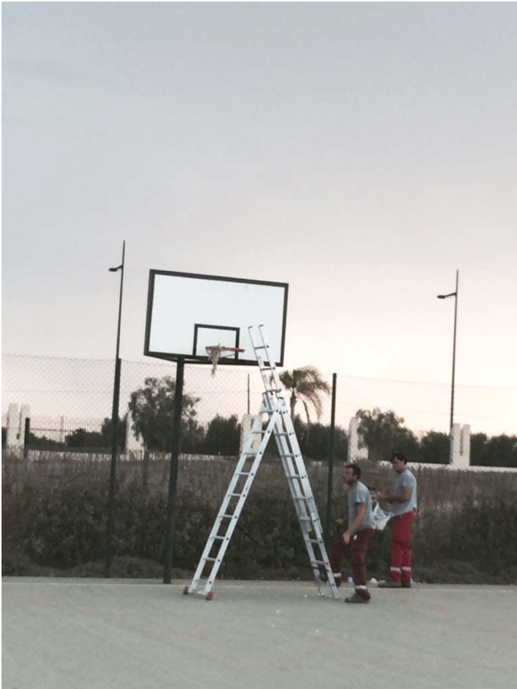
Last Monday, VIGILANT technical service undertook the installation of the alarms in the sports facilities.