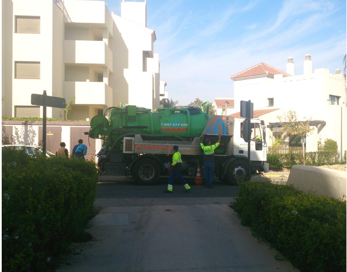
Last Thursday, the maintenance company started the repair and improvement works of the Roda Notice at the main entrance of the Resort.